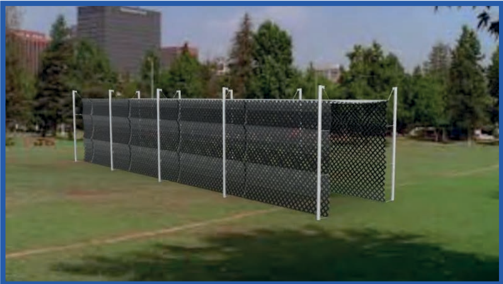
Cricket Cage Ground