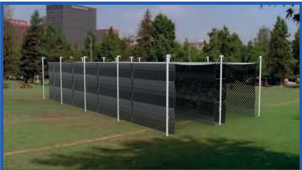
Double Cricket Cage Ground