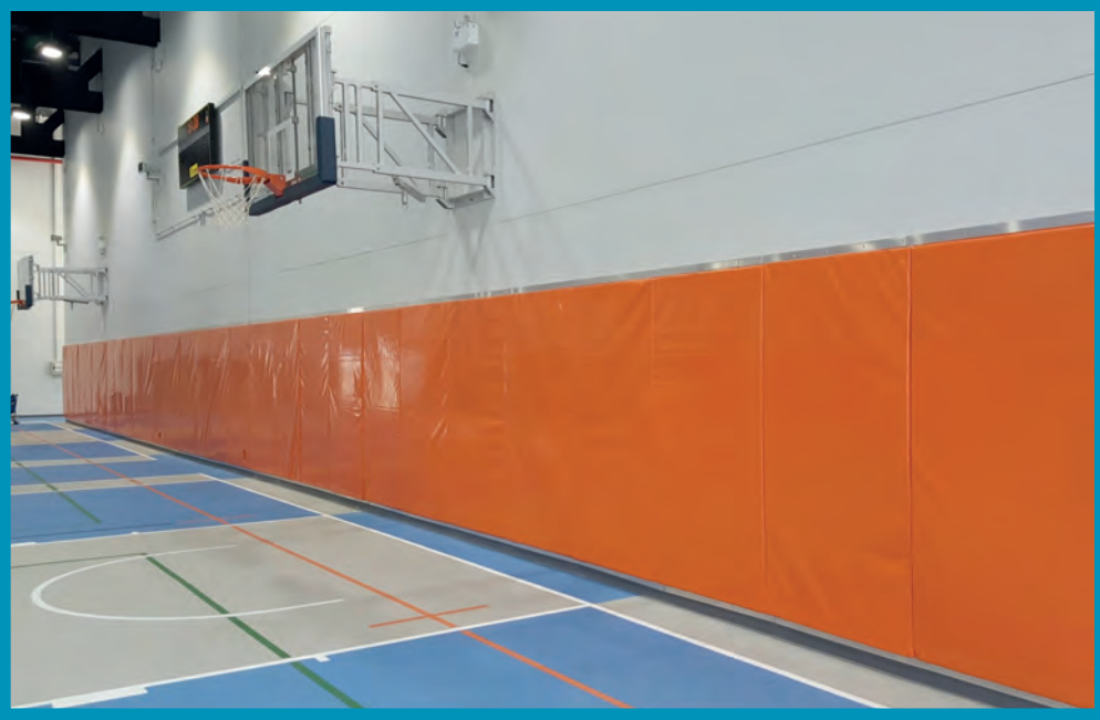
Wall Padding for Indoor ( 2 m )

The wall and column padding are made from a PE foam with a PVC canvas. Both materials used are fire retardant. The padding usually measures a height of 2.0 m. It is available in four and six cm thickness. The standard panel is 1.0 m wide. On demand, another dimension can be produced. The padding is equipped with fastening straps. They are placed at the top and bottom of the padding. The straps are fixed to the wall with aluminium flat bars. Additionally, the padding is held in position with Velcro, which is fixed on the back side of the padding. The padding is available in assorted colours. Special sizes and openings for corners and electrical or other outlets can be customized in accordance with the requirements of the jobsite.