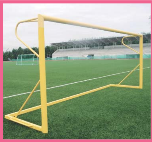
Free standing version