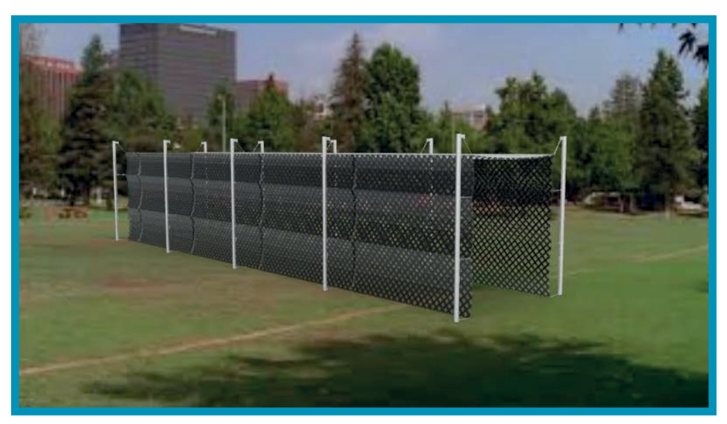
Cricket Cage Ground