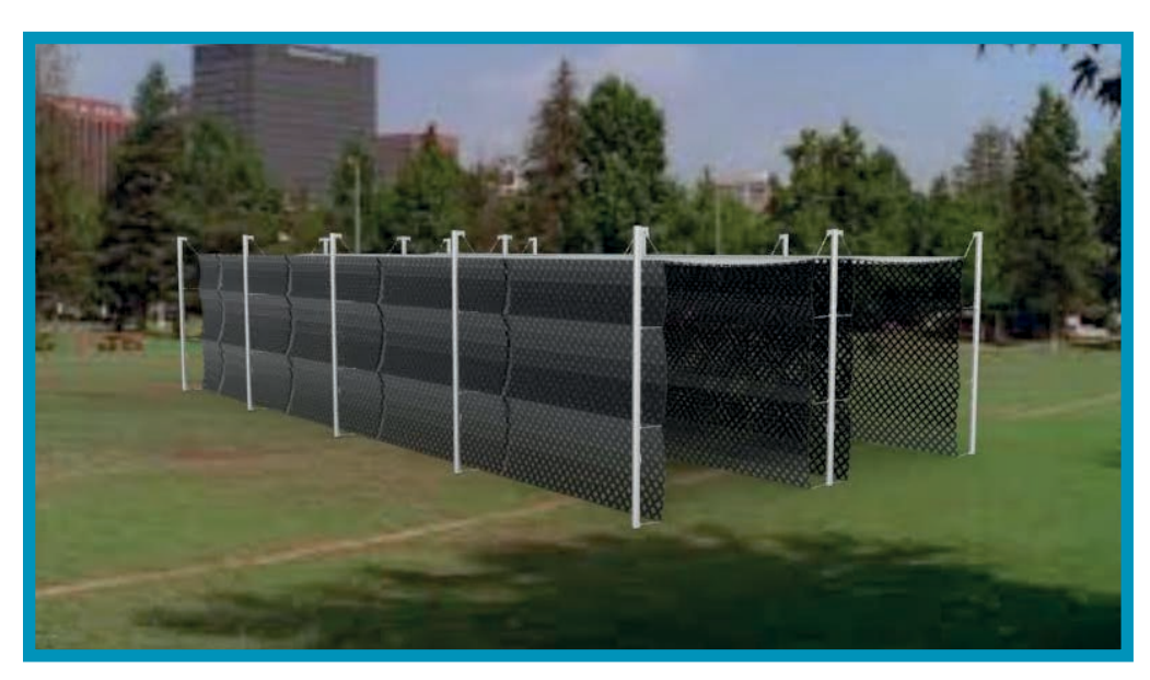
Double Cricket Cage Ground