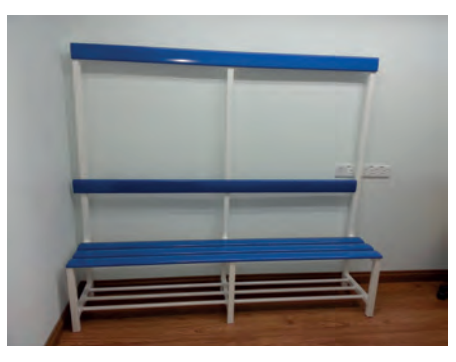
For safety reason we recommend to fix the locker bench to the wall!