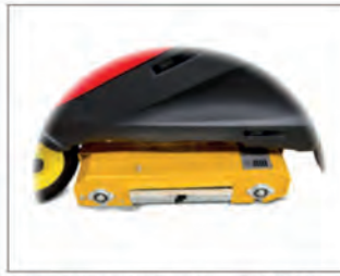
Ground driven rotary brush with adjustable vibrating screen from 4-10mm