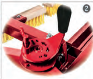
Adjustment spindle lock mechanism for Working depth