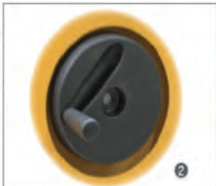
Hand wheel for dedusting of the permanent filter