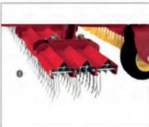
Rows of tines