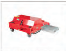
Rotating brush 1.000mm Art.-No.6400029