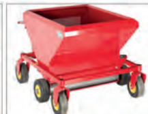
Spreading device.800mm Art.-No.6400133