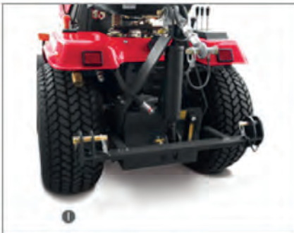
3-point rear attachment system