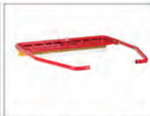
Decompacting-/ Levelling device - Rear-mount attachment Art.-No.6400080