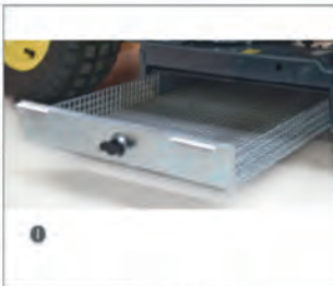
Adjustable sieve from 4-10mm