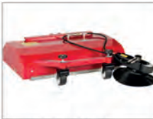
Opposed brush Art.-No.6400177