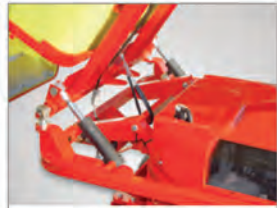
SC2D: Hydraulic lifting for tipping the filter box