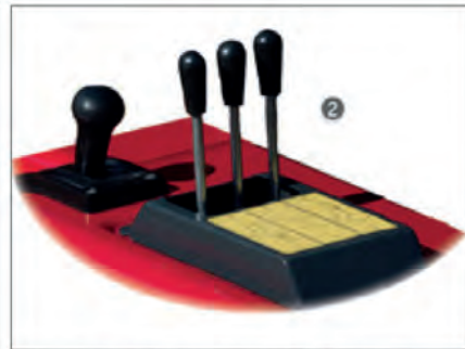
Controls for attachments at the front and rear