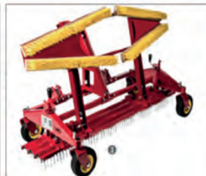
Trailing drag brush, can be folded