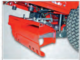
Practical coupling system for mounting all attachment without tools