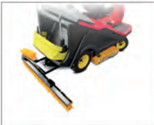
Expanded drag brush, working width 1.600mm