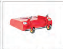
Rotating brush 1.100mm Art.-No.6211213