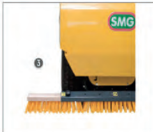
Unilateral overlapped drag brush row