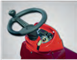
Clearly arranged display - Easy to operate