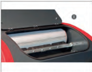
Permanent filter with continuous de-dusting of filtered suspended particles