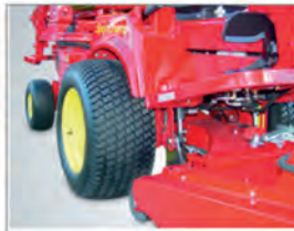
Tires especially for use on grassy surfaces ensure low pressure on the ground