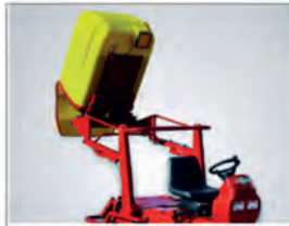
SC2D4HL: Hydraulic high-level emptying up to 2.000mm