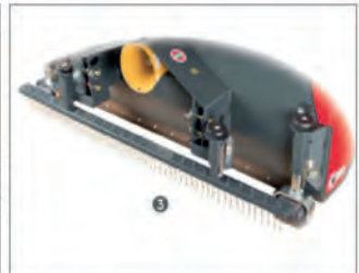
Steel springs for gently loosening of the infilling material