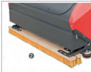
Drag brush with guide pulley