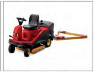
Turfboy TB1 with drag brush DB1600