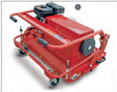
Foldable steering arm for easy transport and storing in a small place