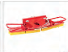
Rigid brush - Front-Mount attachment Art.-No 6400093