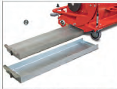
Extractable filter sieve different sieve sizes available