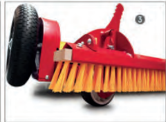
Fold-out transport rollers for transverse drive