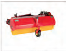
Sweeping brush Art.-No.6400027