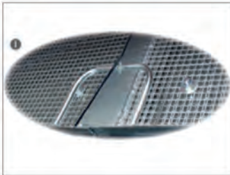
Vibrating screen adjustable from 4-10mm