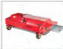
Rotating brush 1.500mm Art.-No.6400017